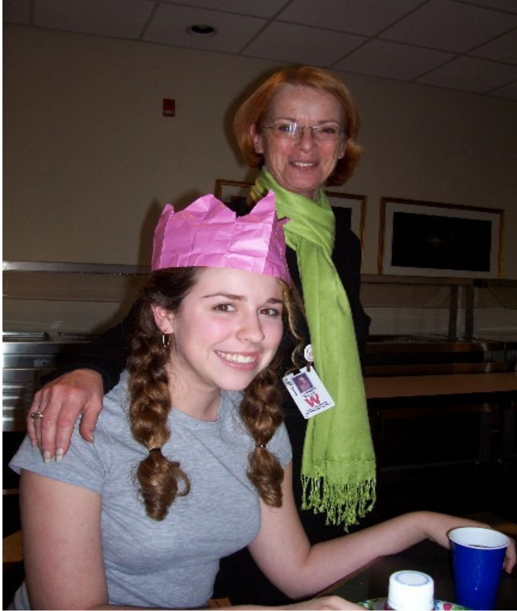
Wando French Club Epiphany celebration