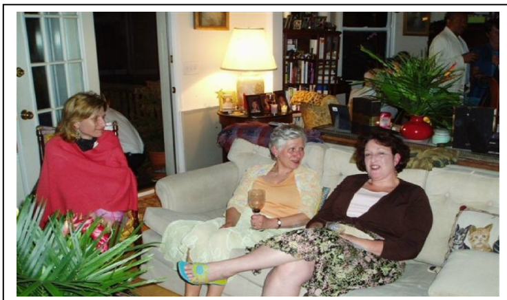
Dinner at the Arnaud after Dr Knock play