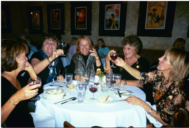
Beaujolais Nouveau 2006 at Mistral...