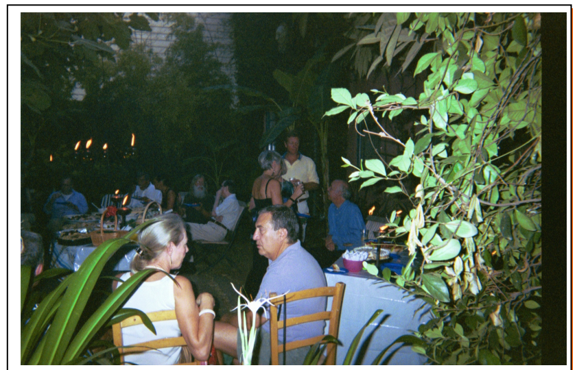
A summer gathering in Isabelle's garden